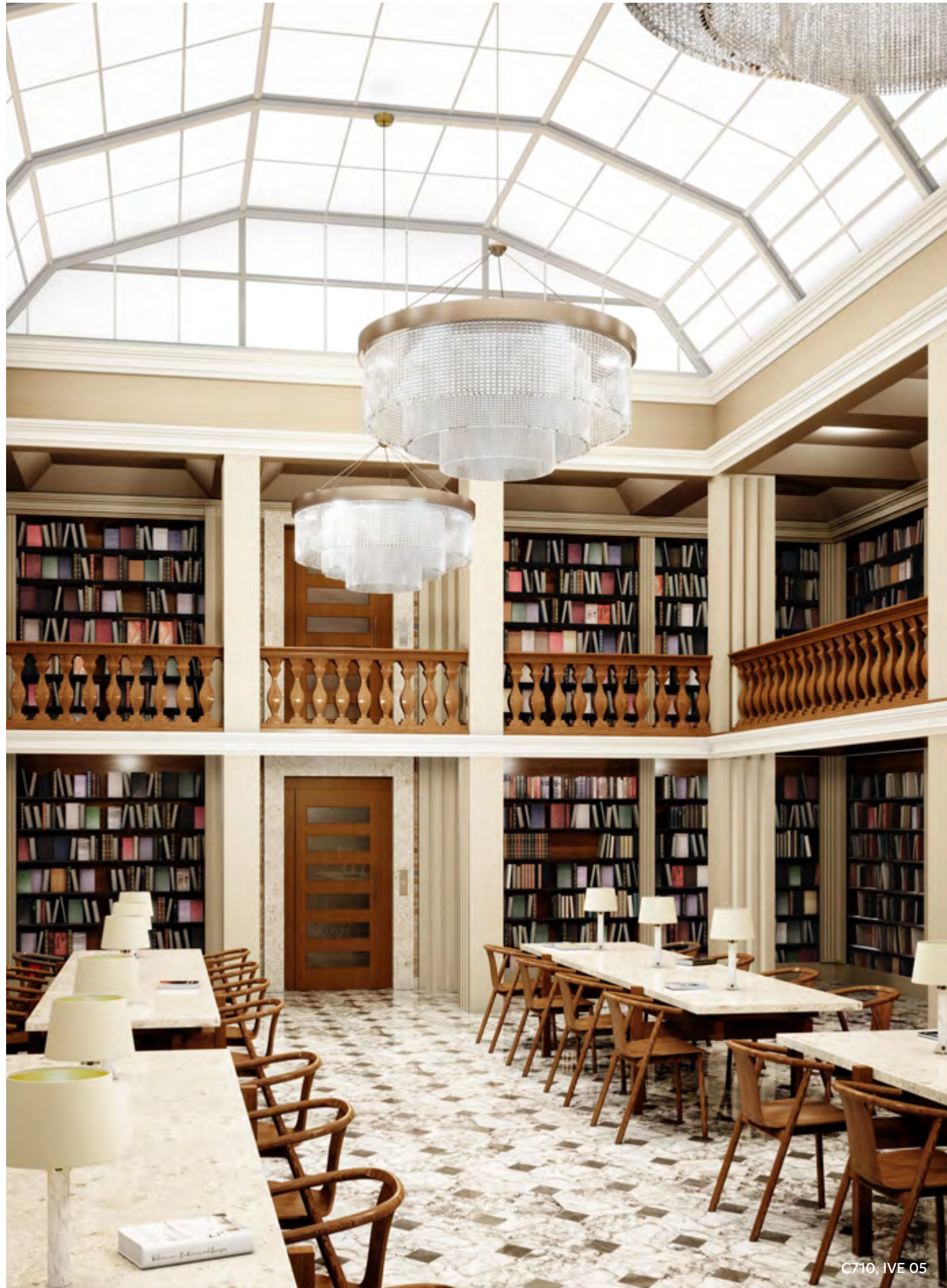
C710, IVE 05