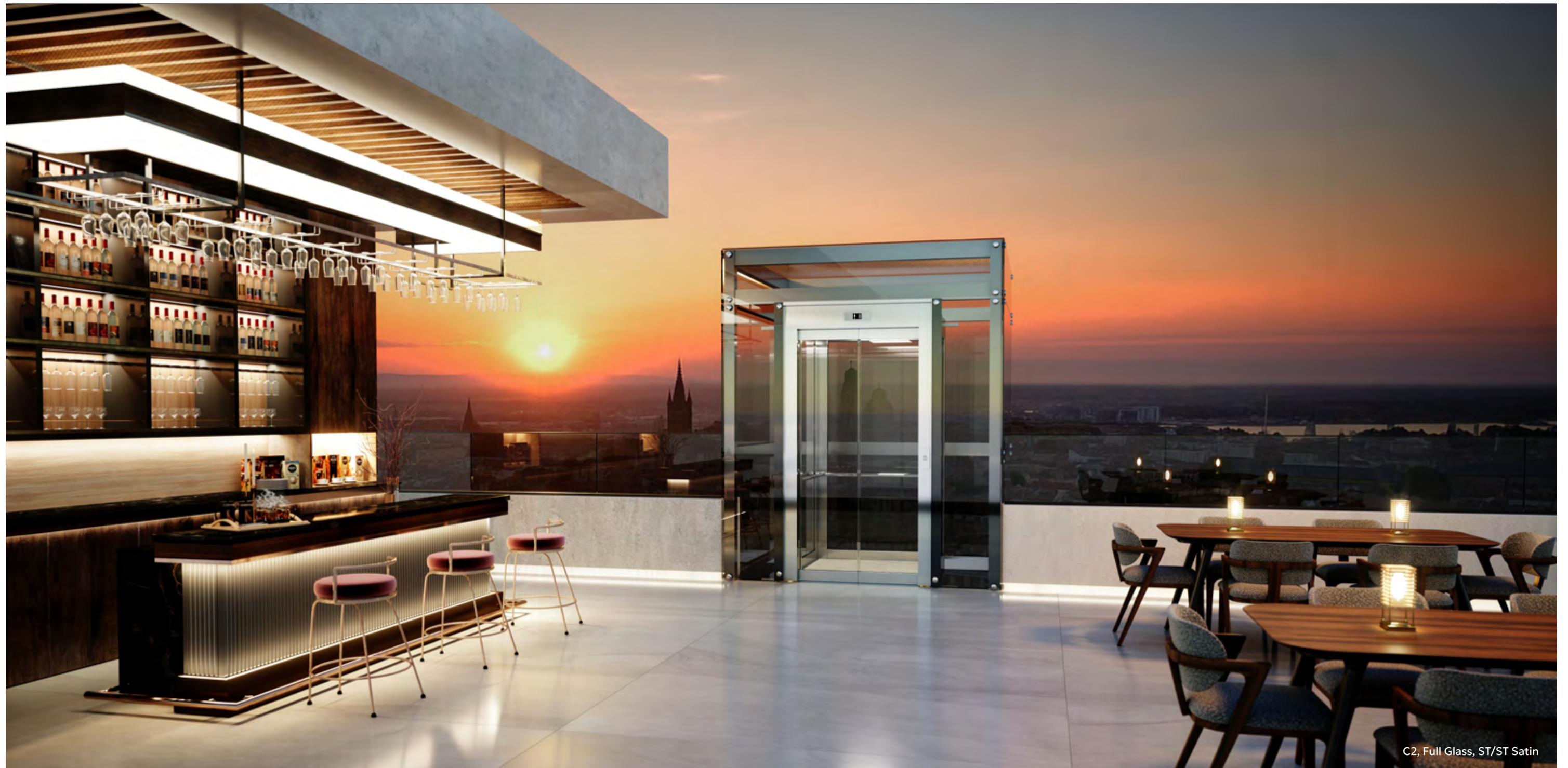
C2, Full Glass, ST/ST Satin

offer a minimalist solution that adapts easily to the surrounding environment. Large glass panels reduce visual barriers, making interiors feel connected and expansive. Whether used in residential, commercial or hospitality settings, KLEFER lift doors enhance a clean, modern aesthetic while preserving openness and transparency.