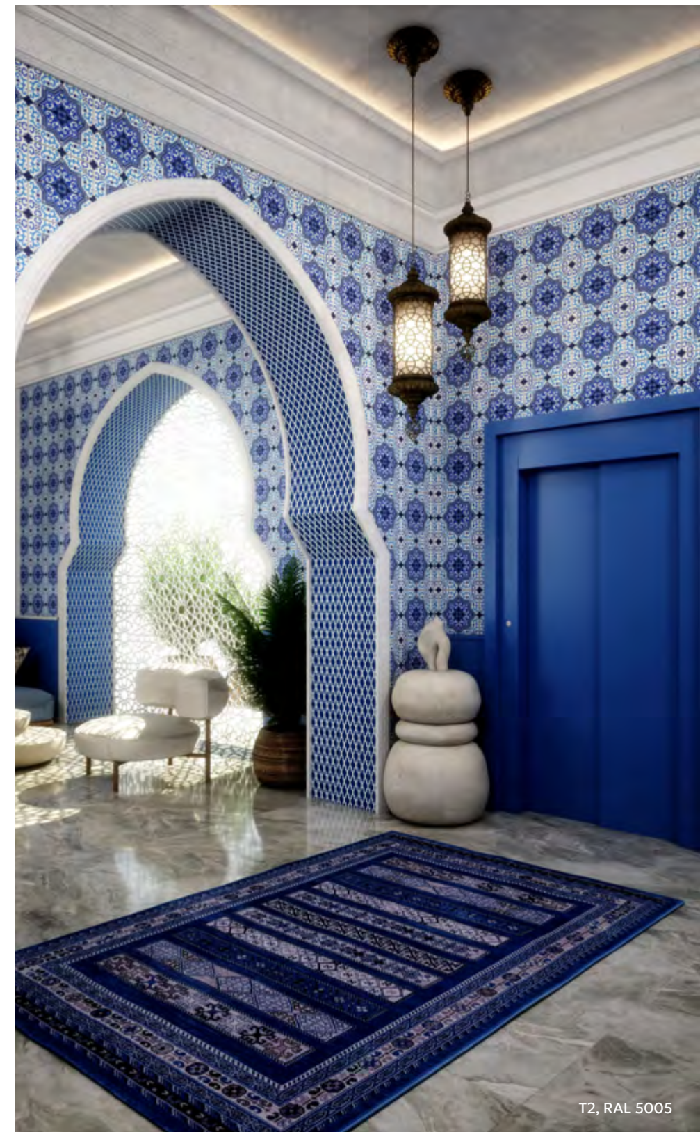
T2, RAL 5005

Enhance the Arabic-style aesthetic with rich gold and bronze finishes. Incorporate deep warm tones like emerald green, royal blue or ruby red to evoke luxury and tradition, transforming your lift doors into a distinctive design of elegance and cultural sophistication.