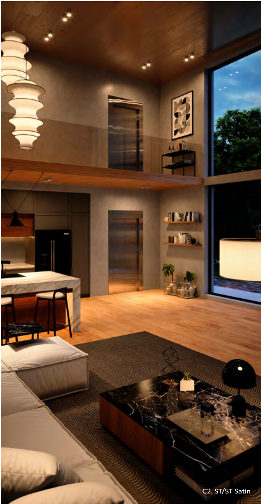
C2, ST/ST Satin

In contemporary living spaces, where style meets function, choose lift doors that harmonize with clean, open interiors while delivering consistent, effortless performance. Select finishes and materials that resist everyday wear and maintain their sleek appearance over time.