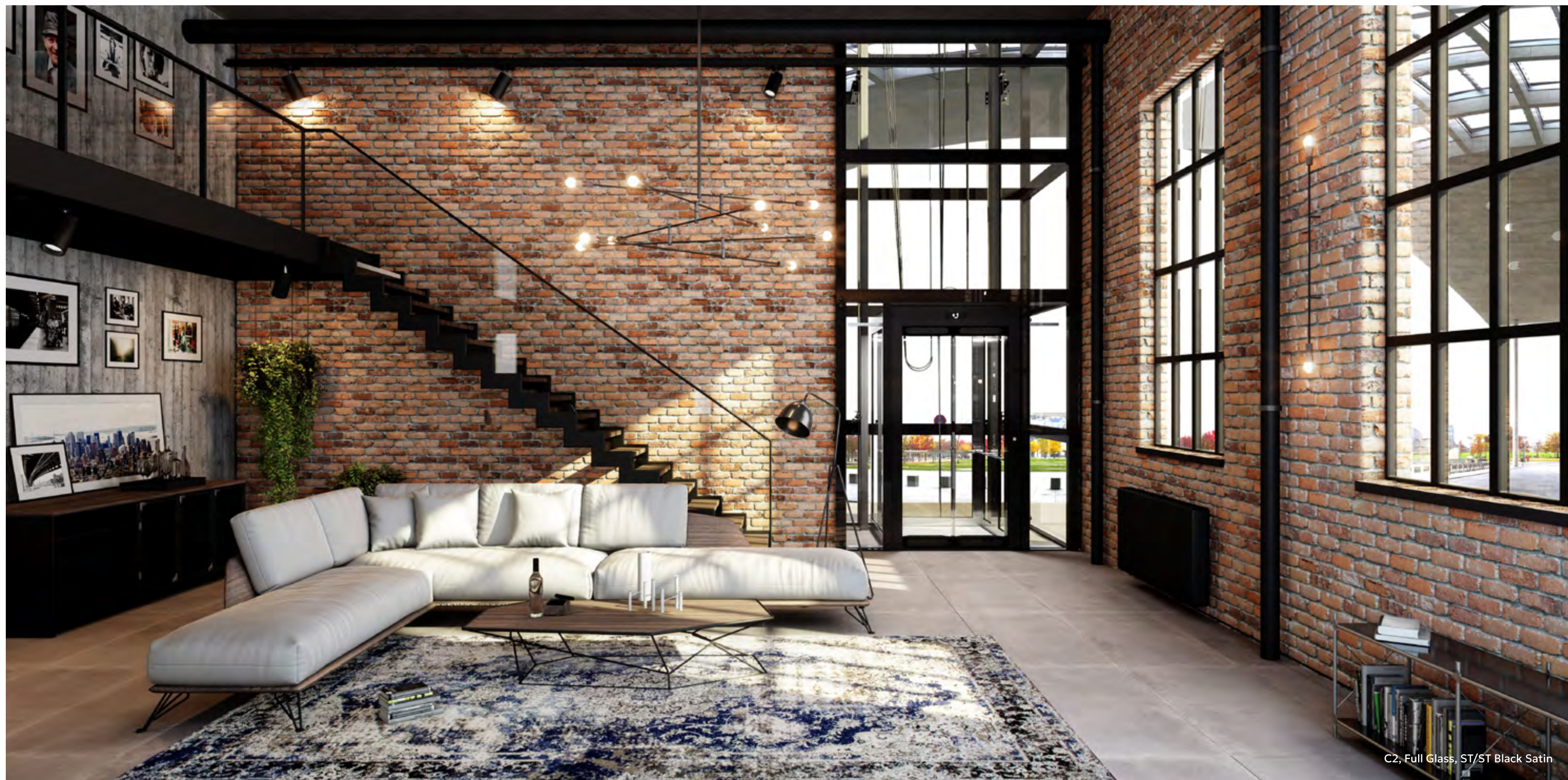
C2, Full Glass, ST/ST Black Satin

Their sleek, functional form complements the industrial style while enhancing the visual impact. KLEFER lift doors bring lasting appeal to interiors, making them a distinctive choice for those who value design that stands the test of time.