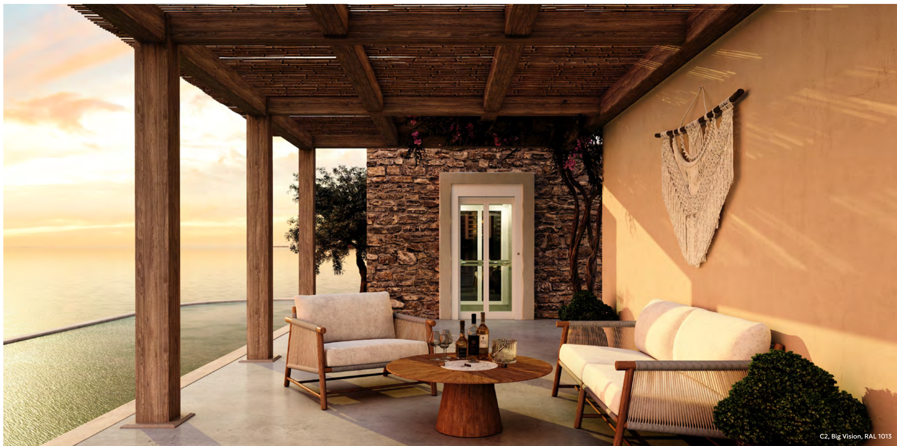
C2, Big Vision, RAL 1013

materials complement the light-filled, airy atmosphere typical of Mediterranean design. Combining functionality and sophistication, KLEFER lift doors elevate any setting, perfectly balancing form and function. Choose panoramic lift doors to fill your space with natural light, creating an inviting and harmonious atmosphere.