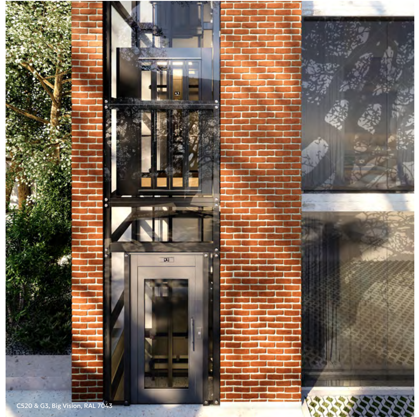
C520 &amp; G3, Big Vision, RAL 7043

Sill: Enhance your interiors with our colored anodized sills, creating a harmonious blend of elegance and modern appeal.