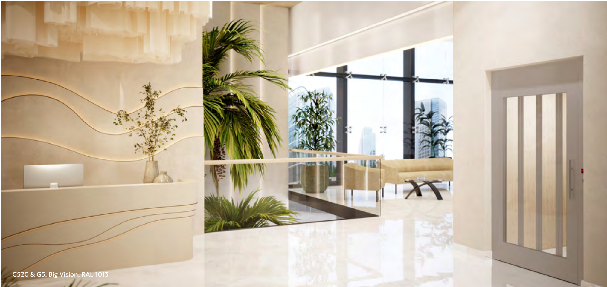
C520 & G5, Big Vision, RAL 1013