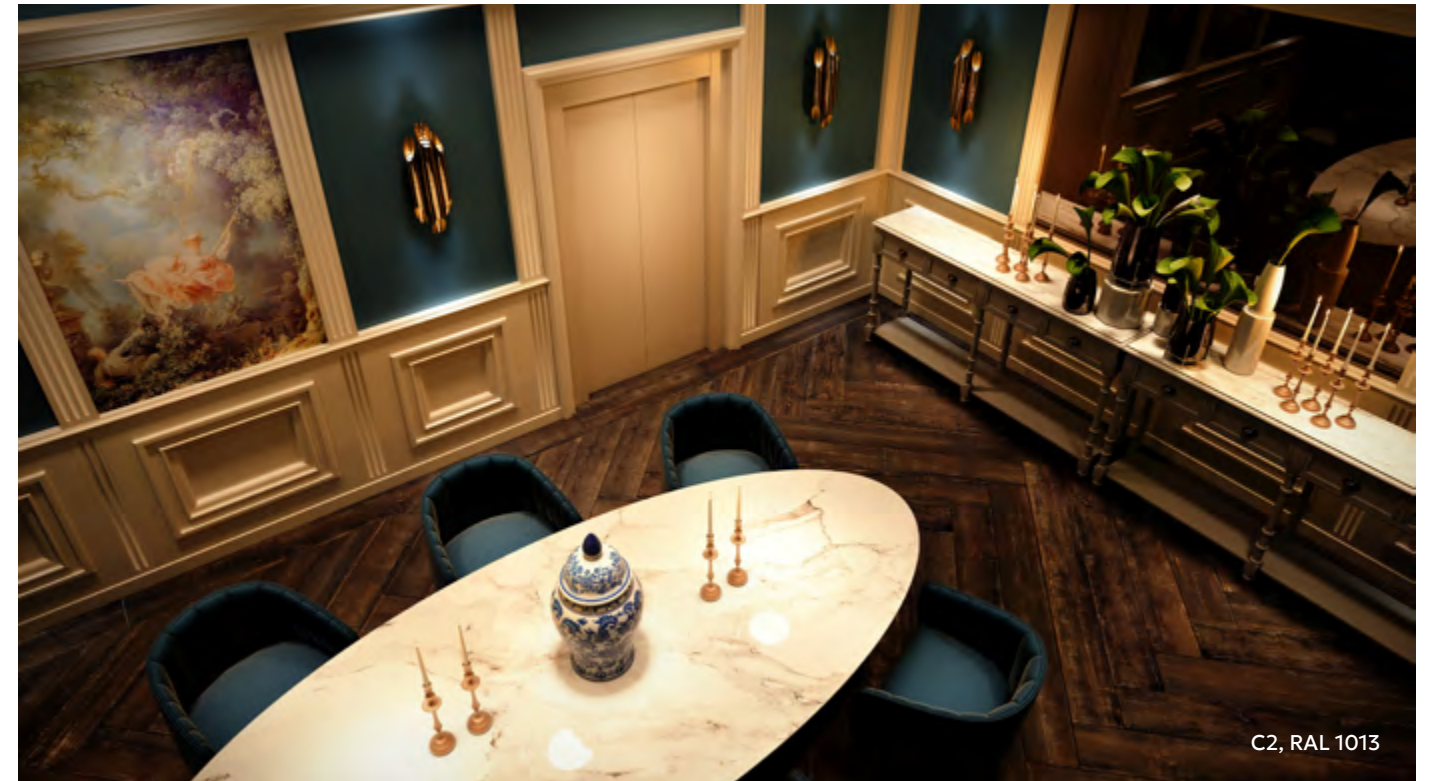
C2, RAL 1013