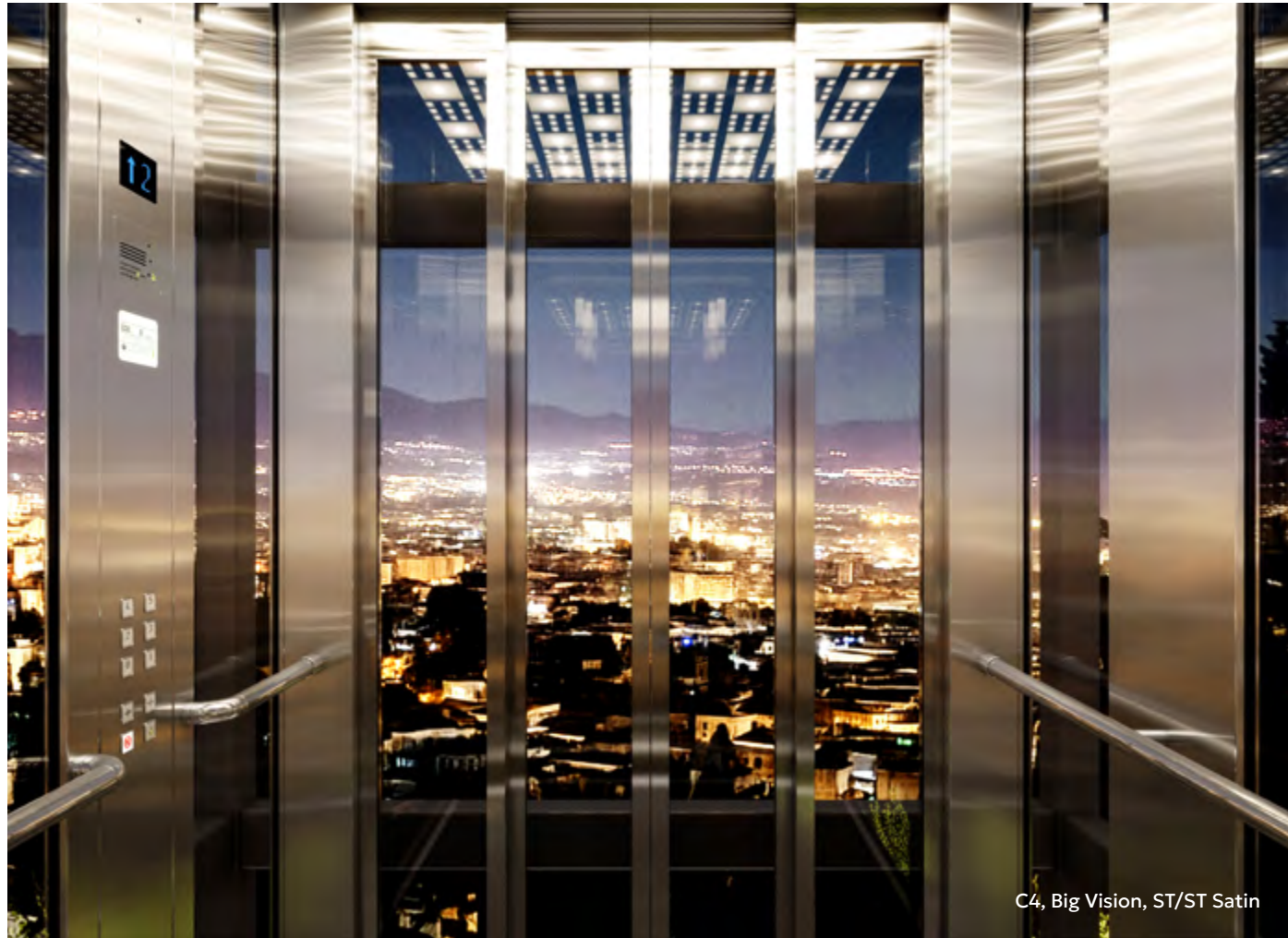
C4, Big Vision, ST/ST Satin