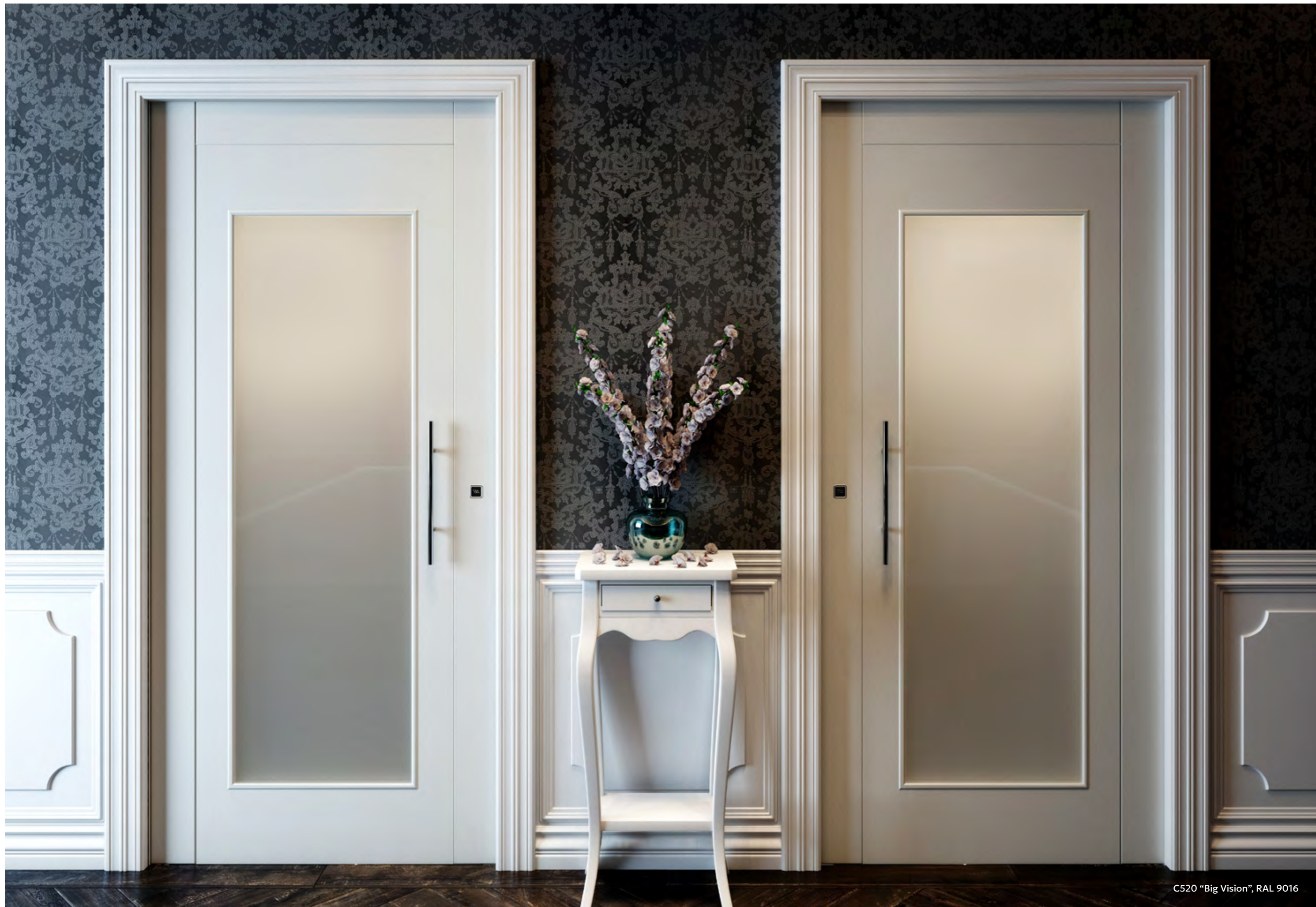
C520 "Big Vision", RAL 9016