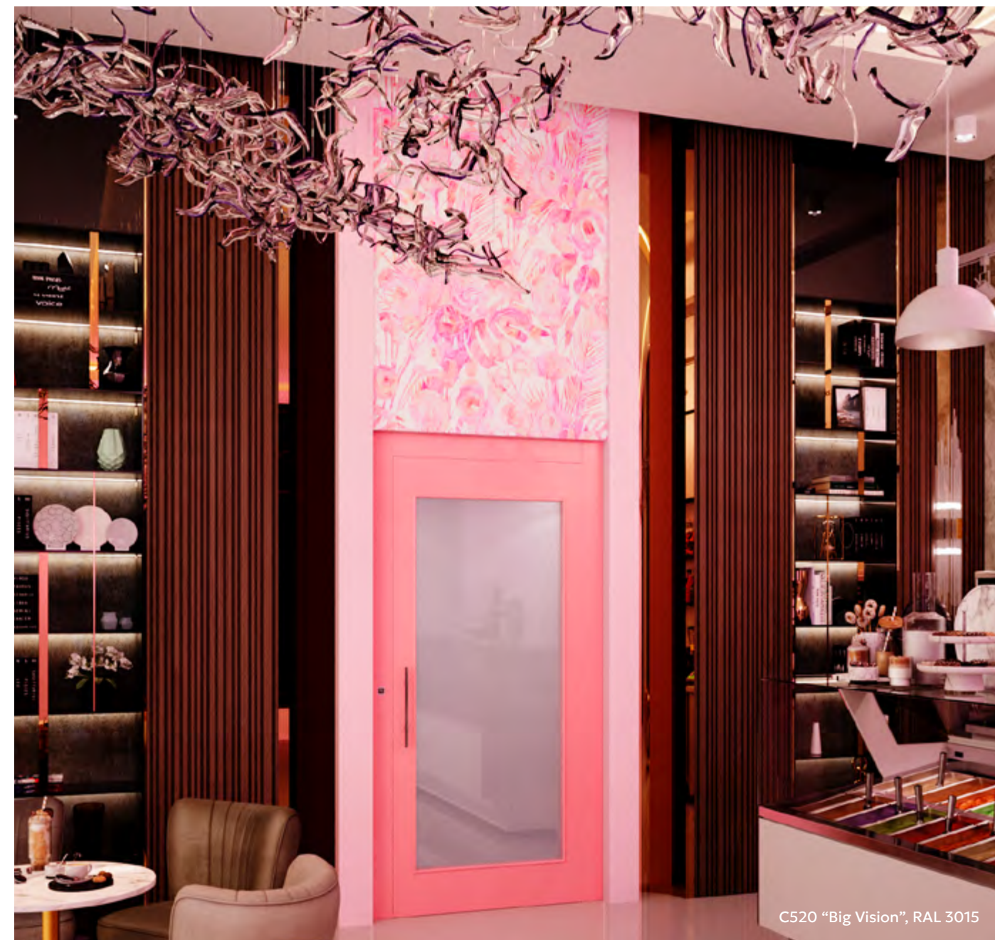
C520 "Big Vision", RAL 3015

Sill: Enhance your space with anodized sills in a range of colors, engineered to deliver a touch of finesse and modern luxury.