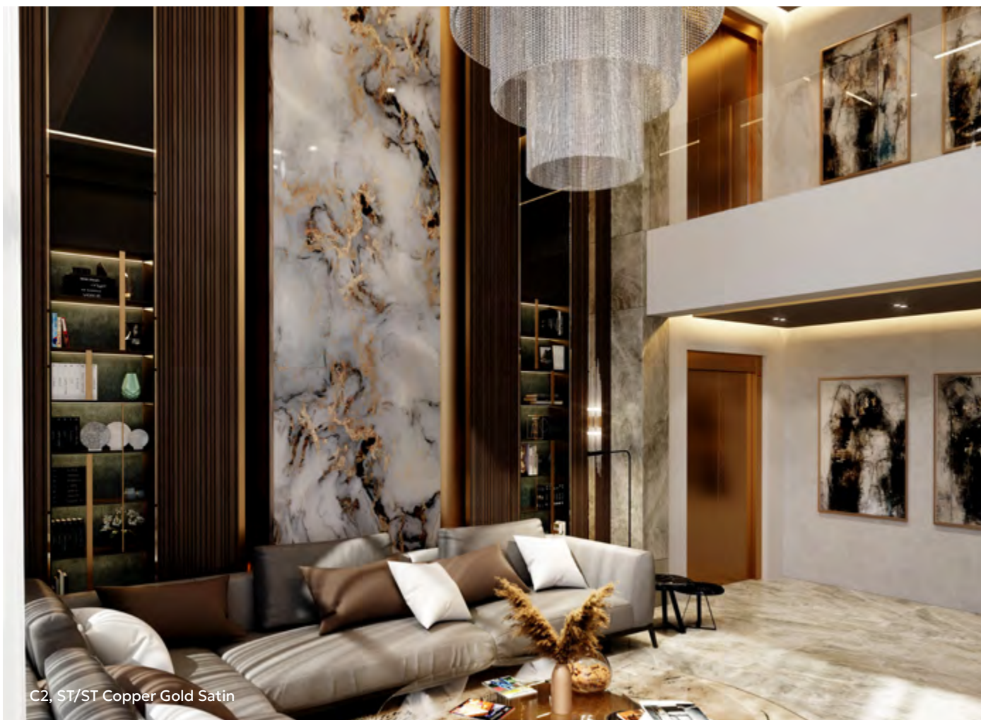
C2, ST/ST Copper Gold Satin