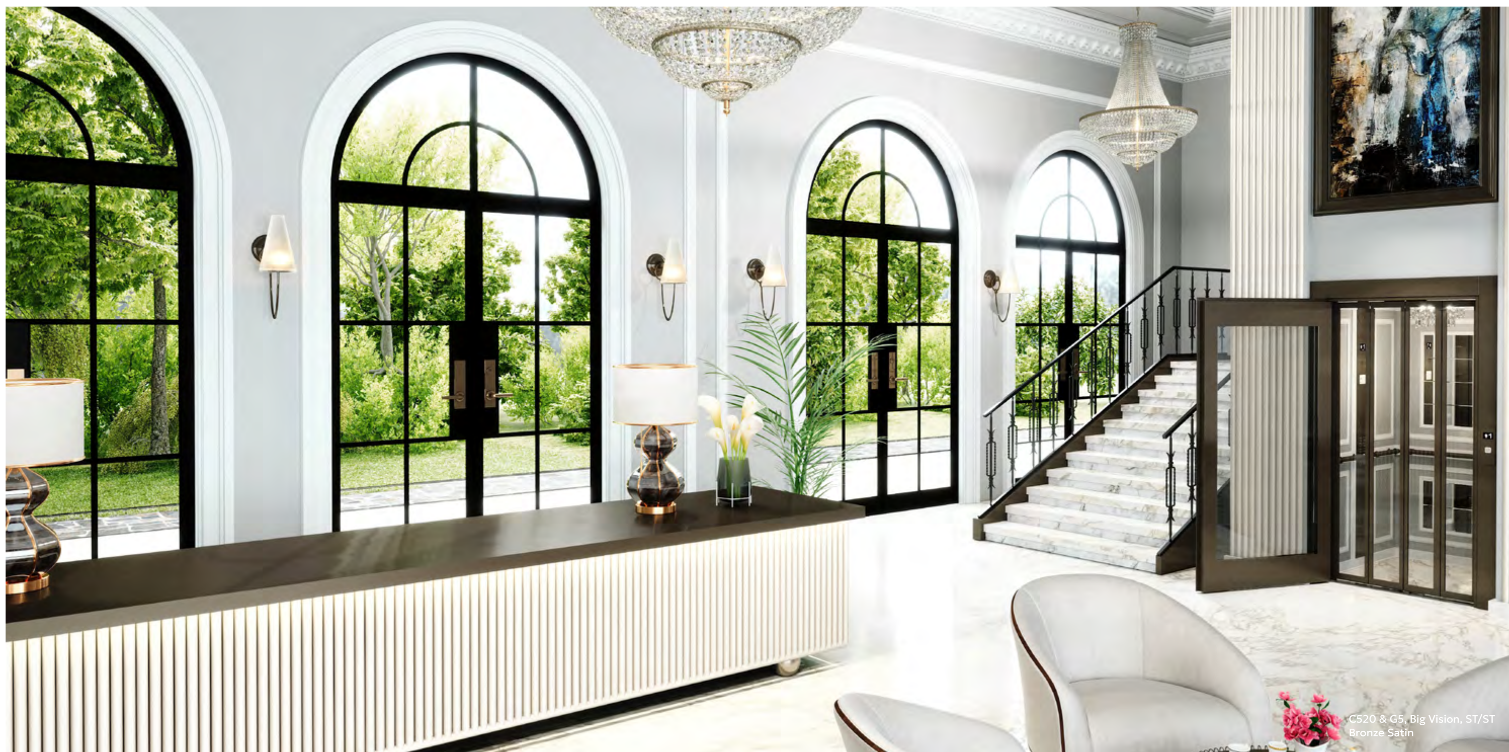
C520 & G5, Big Vision, ST/ST Bronze Satin

Lift doors, with premium materials and elegant finishes, ensure seamless functionality while contributing to visual harmony and a cohesive architectural expression. Embracing this philosophy, KLEFER lift doors blend innovative technology with refined aesthetics to elevate luxurious living environments.